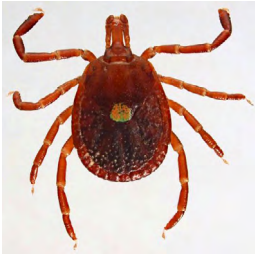
Lone Star Tick