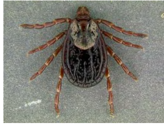
American Dog Tick

initially has flu-like symptoms and sometimes an expanding red rash at the bite site. Months or years later the disease can invade the neurological or cardiovascular system or joints of the body. Lyme disease mimics other diseases, such as rheumatoid arthritis. The characteristic bull's-eye rash only occurs in about 70% of the cases. Early treatment with antibiotics is much more effective than treatment months or years later.